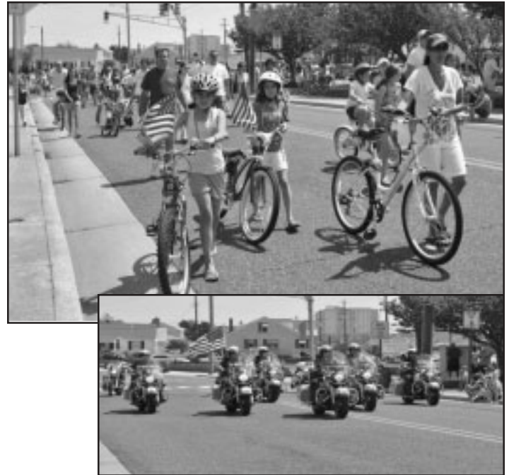
Longport's Annual Memorial Day parade is the start of the upcoming summer season. The parade was led by the Longport Police Department's motorcycle patrol unit.

The following beaches will open and close as indicated: