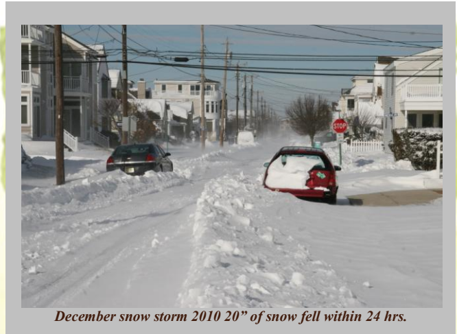
December snow storm 2010 20" of snow fell within 24 hrs.