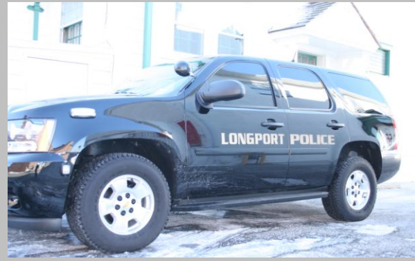
Three new Police Department 2011 Chevrolet Tahoe's contain state-of-the-art computers, new-era graphics and emergency lighting on their interior. Flag one down the next time it passes your house & have a look. But we highly recommend that you try to stay out of the back seat!